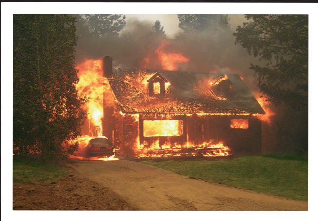
This house was ignited by burning embers landing on vulnerable spots. Notice the adjacent forest is not burning.

Maintain wooden fences in good condition and create a noncombustible fence section or gate next to the house for at least five feet.